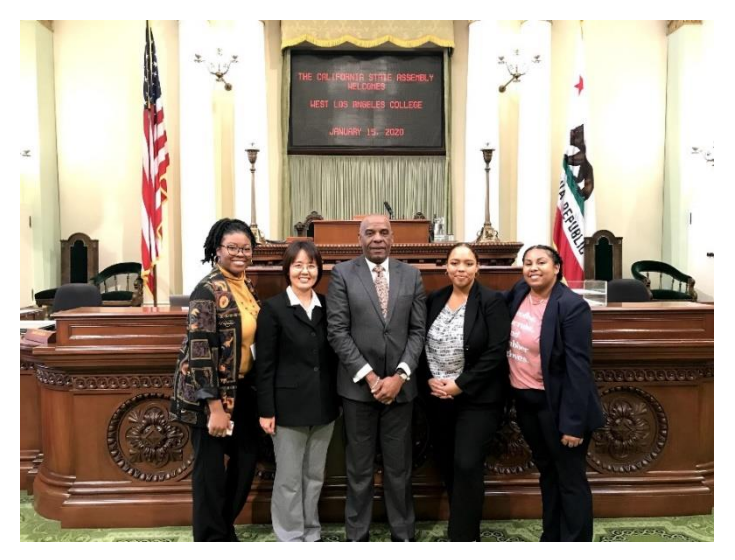
WLAC students with State Senator Steven Bradford (District 35)

include performing non-invasive procedures without the supervision of a dentist. The bill will also increase the work settings where RDHAPs can practice at hospitals, medical offices and other healthcare settings. WLAC is the only California college that offers an RDHAP program. This program prepares Registered Dental Hygienists to operate their own dental hygiene practice in under-served areas or in nursing facilities.